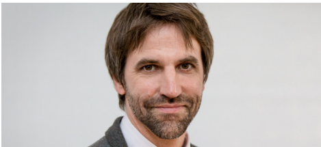
Steven Guilbeault Cofounder and Senior Director, Equiterre